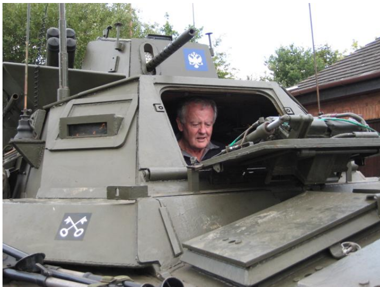
And finally, the star attraction of the show, leading to.....