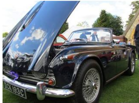
Just as well presented under the bonnet as externally