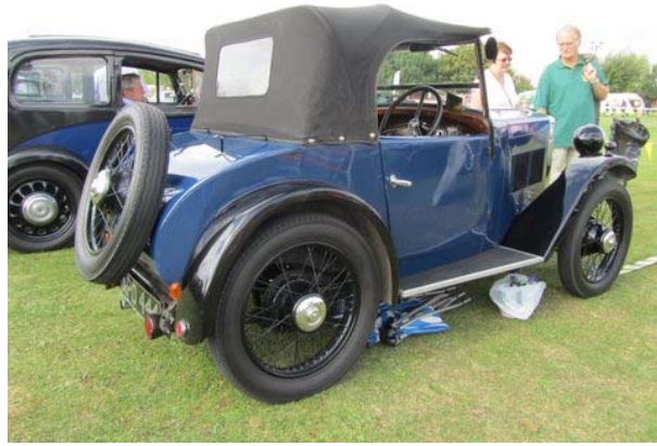
and a very tasty hybrid Salmson Bugatti.