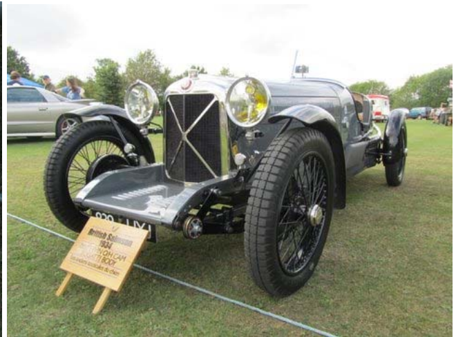
Some of the heavy brigade wanted a push start but our members didn't have enough steam in their engines to help!!