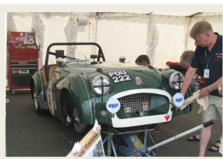
Mark Hoble TR 2

Cars are grouped into different age groupings for racing, the TRs being spread over the '49-'59 group and the '57-'61 group. Many exotic machines, too numerous and outrageous to mention here, were included in the six groups, and racing in both daylight and darkness made for a petrol head's perfect weekend. There are already many web sites relating to the event but it is hoped we can put a taste of Northumbria at Le Mans on our own site shortly.