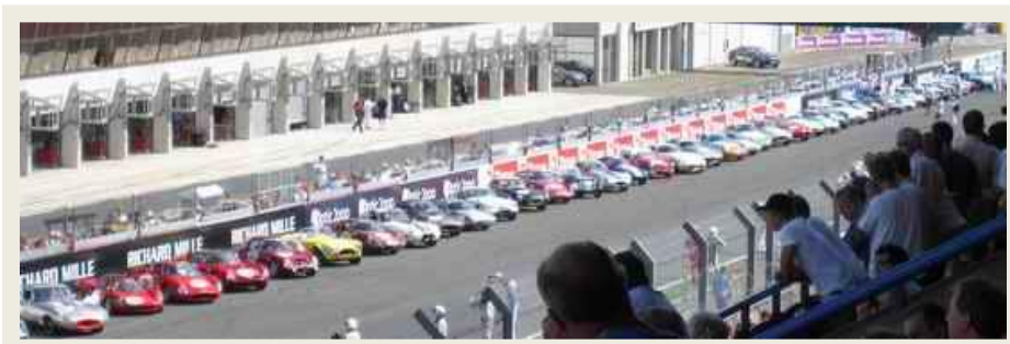
Ready to roll at Le Mans