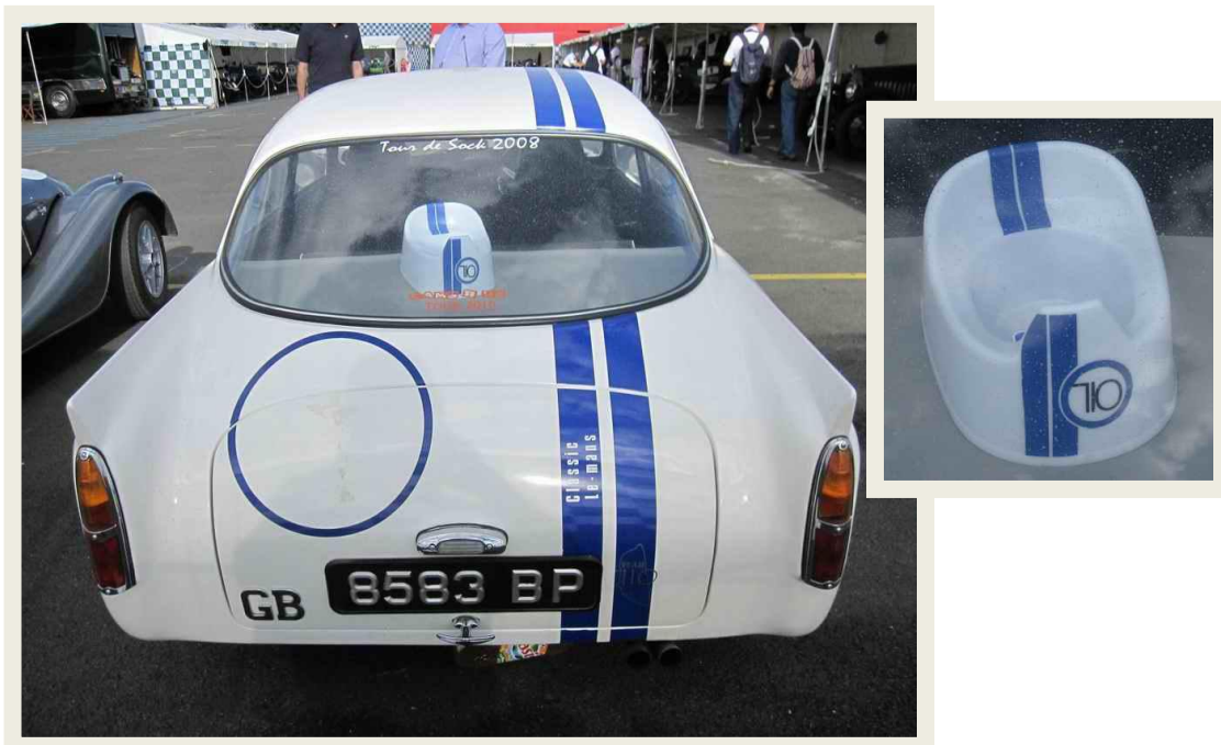
Peerless and accessory seen at Classic Le Mans