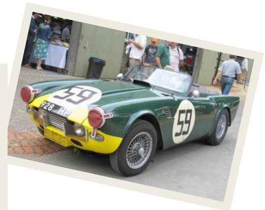
928 HP at Malvern