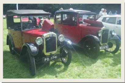
Austin Twins at the Party