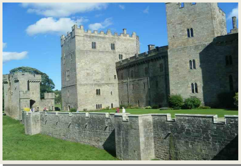
Just in case you didn't believe there was a Castle