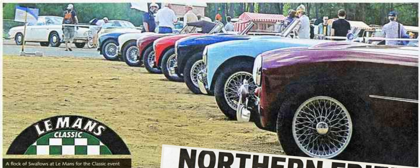
A flock of Swallows at Le Mans for the Classic event