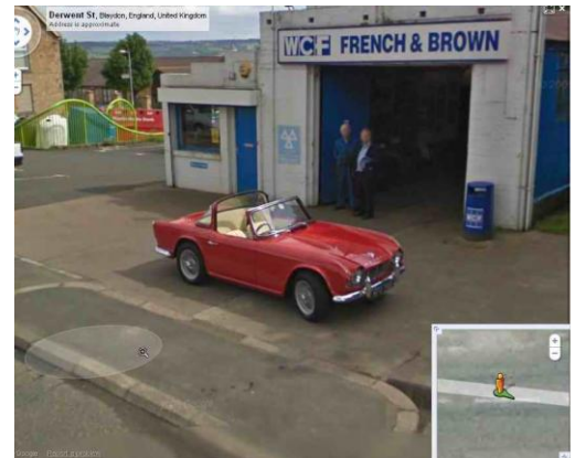
Period scene that Tom Hall found

From the last issue of TR Action you will have noticed that the TR Register Coca Cola TR7 will be appearing at the Top Gear Live MPH show in London and Birmingham during November. The press release gives the following links for you to check out more detail of the car.