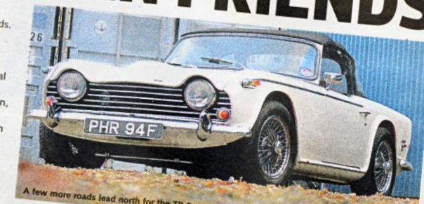
A few more roads lead north for the TR Register next year

"To be honest we have a lot of members and we did hear various comments about our lack of Northern presence. We agreed completely, and decided to take action."