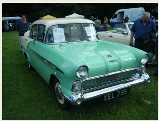
Vauxhall Victor a Rare Sight