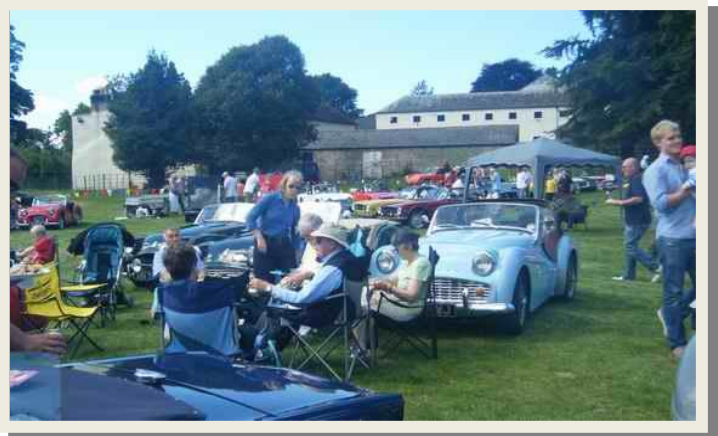
A Family Day Out at The Castle