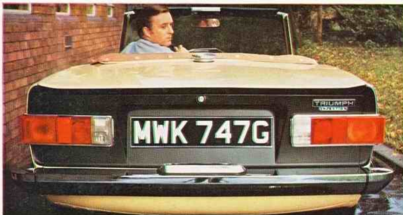
All-round Functional Elegance

Nothing. That bend might never have been there. With its all-round independent suspension, plus wider track, 5\frac{1}{2} J rims and new anti-roll bar, the TR6 P.I. beats any previous TR for roadholding. And that's really saying something.