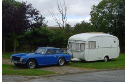
Dave's Touring Rig