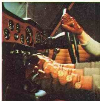
Everything under instant control