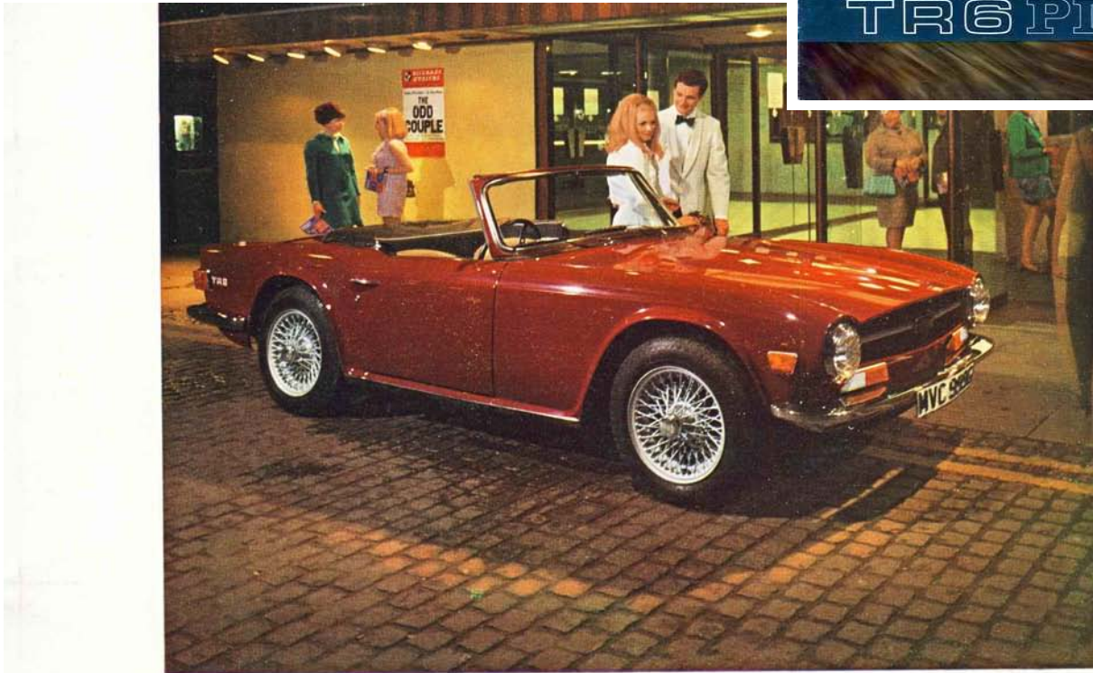
Designed for the man who lives and drives in style