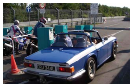
Starting the Nurburgring

IWE Malvern , attracted the usual Northumbria 6.30 am Friday morning convoy which enabled them to to `bag` Northumbria's favourite corner camp site plus tree. Prominent this year were a number of canine TR supporters. Yes you read that correctly. The introduction of the weekend dog class seems to be as serious as the TRs and Northumbria had five canine visitors this year. Stocking up on spares, bargain spotting and car watching were all as good as ever and all returned North without drama. In the absence of a first hand report from any members who attended, Simon Rutter our contact inside the Yoof Group has come up trumps with a report on Malvern from his perspective.